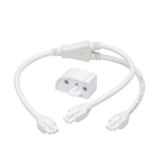
Y Jumper cable