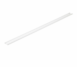
Mounting rail, white, 991 mm