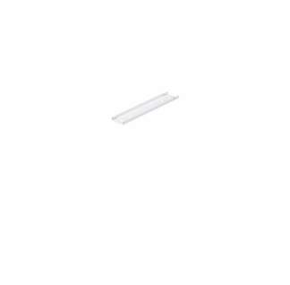
Mounting rail, white, 229 mm