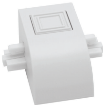
White in-line end-to-end coupling piece 120 V, 5 pieces