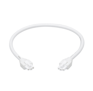
Jumper cable, 152 mm