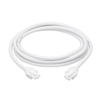
Jumper cable, 1525 mm