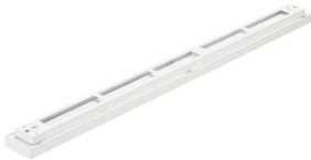
TrueLevel_Surface Mounted- SM540C-3DPP.TIF