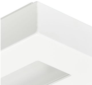
TrueLevel_Surface Mounted- SM540C-2DPP.TIF