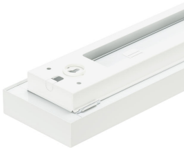
TrueLevel_Surface Mounted- SM540C-5DPP.TIF