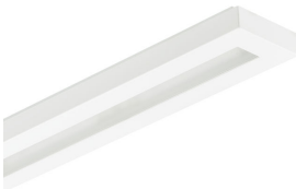
TrueLevel_Surface Mounted- SM540C-7DPP.TIF