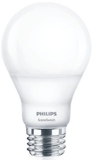
E26 A19 Frosted