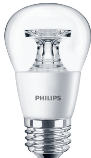
E26 A15 Clear