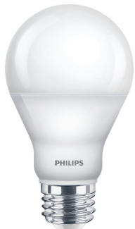
E26 A19 Frosted