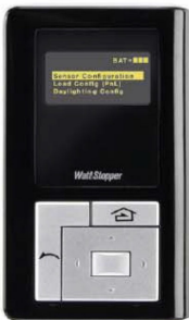
Ordercode Prog MR Rem