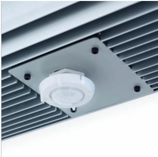
Ordercode Prog MR