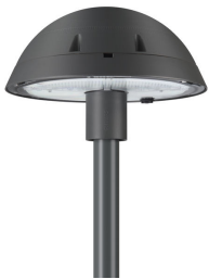
TownTune CPT DTD BDP263