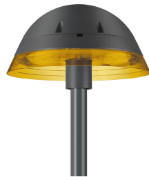
TownTune CPT DTD DR GO BDP263