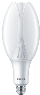
Trueforce E27 Others Frosted