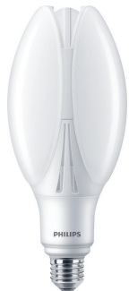
Trueforce E27 Others Frosted