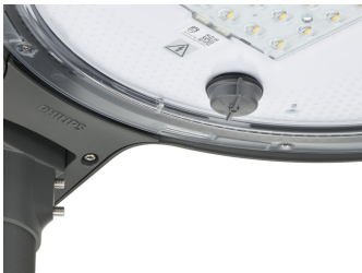
TownTune ASY BDP265