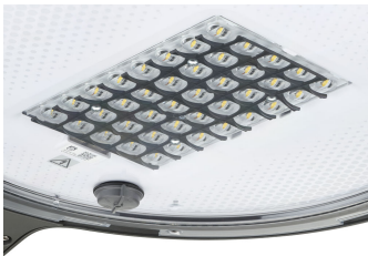
TownTune ASY BDP265