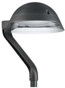
TownTune LYR DTD DR BDP273