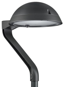
BDP273, TownTune Lyre with decorative top dome