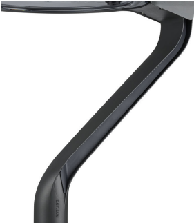
TownTune LYR BDP270