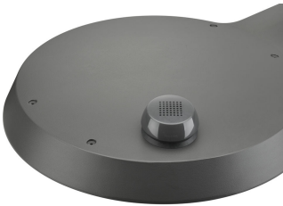
TownTune ASY BDP265