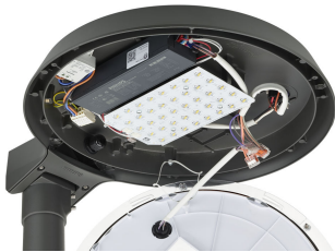
TownTune ASY BDP265