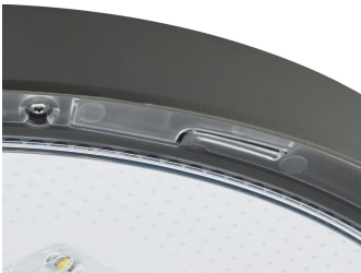
TownTune ASY DR BDP266