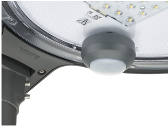
TownTune ASY BDP265