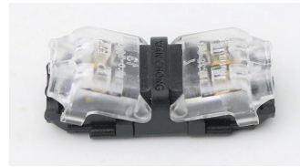
ZGC201 Cable Connector

Ordercode 911401720292, 911401720322, 911401720332, 911401728332