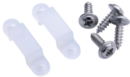
ZGC201 Mounting Kit

Ordercode 911401720292, 911401720322, 911401720332, 911401728332