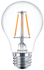
E26 A15 Clear