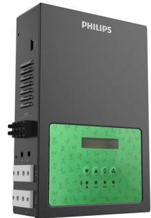
Solar Indoor System Compact 400 3.3