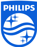
ELE BALLAST (3) F32T8 120-277V