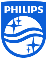
HPS BAL 150W S55 QUAD KIT WITH LAMP