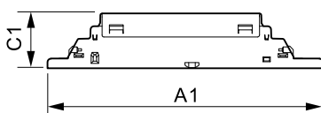
HF-S 224-39 TL5 II 220-240V 50/60Hz