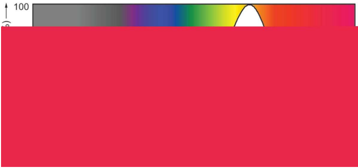
Spectral Power Distribution Colour - MASTER LED 4-35W 3000K MR16 36D