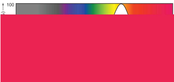
Spectral Power Distribution Colour - MAS LEDtube 1200mm UO 18W 830 T8 RS